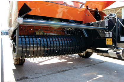
Spring loaded pick-up with flared intake