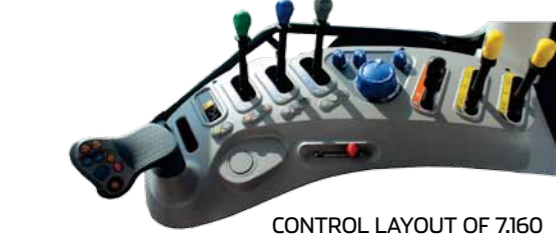
CONTROL LAYOUT OF 7.160

The electro-hydraulic engagement PTO features two shafts with either 6 or 21 splines. The transmission provides four speeds 540/540E/1000/1000E rpm. The electronic control of the PTO always ensures smooth and modulated implement start-up.