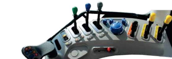
CONTROL LAYOUT OF 7.160